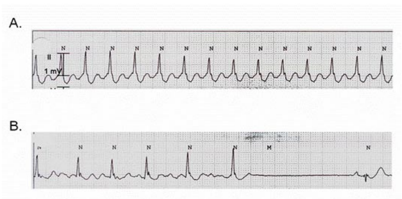
Figure 3: A telemetry strip recorded from a patient who developed an organized atrial tachycardia while being treated with flecainide following catheter ablation of atrial fibrillation. Flecainide was discontinued when the patient was admitted to the hospital the night before a scheduled repeat ablation procedure. During the evening, the atrial tachycardia degenerated into atrial fibrillation and then converted to sinus rhythm. We hypothesize that in some cases, slow conduction facilitated by Class IC agents may facilitate organized atrial tachycardias after ablation. We have found that on occasion, a trial of antiarrhythmic drug cessation can result in termination of these organized tachycardias.

patients are extremely motivated to discontinue warfarin, and instructing patients to continue warfarin when no detectable AF is present can be challenging. Furthermore, anticoagulation with warfarin increases the risk of intracranial hemorrhage two to five-fold. 22, 25 However, as documented by Shah and colleagues, late AF recurrences can occur, even after several years of apparent freedom from AF following ablation. 9 Thus, the optimal anticoagulation strategy following AF ablation needs to be tailored to the individual risks and preferences of the patient. Three series have examined the safety of discontinuing warfarin following AF ablation. Oral and colleagues studied 755 patients with paroxysmal (490) or chronic (265) AF. Fifty-six percent had CHADS 2 risk scores of 1 or greater. 26 AAD were discontinued two to three months following ablation. All participants were anticoagulated with warfarin for three months following ablation, and then warfarin was discontinued in patients without symptomatic AF recurrences. Some thromboembolic events occurred early after ablation despite warfarin use, most (7 of 9) in the first two weeks. Of the 522 patients who remained in sinus rhythm during the first three months, aspirin was substituted for warfarin in 79% of those