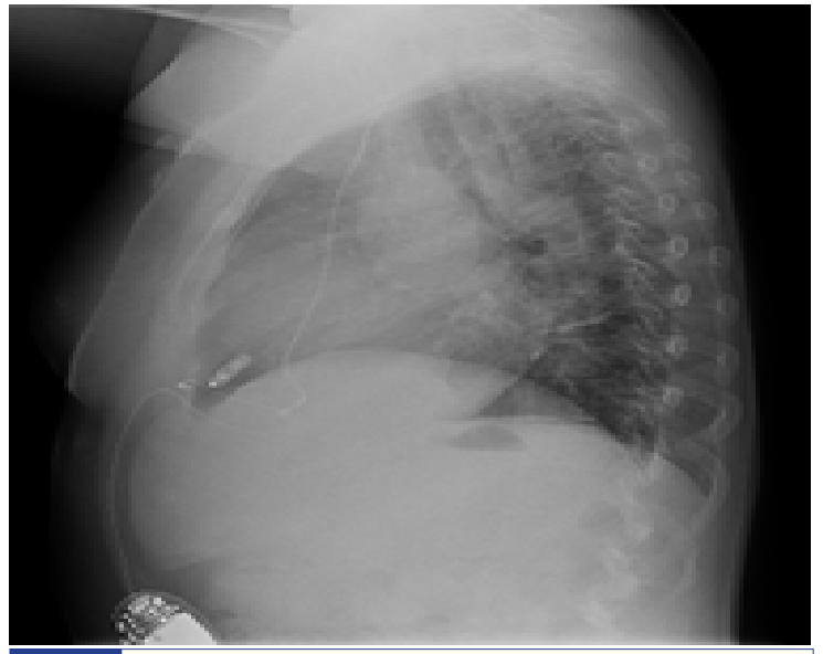
Figure 4: Post-implantation lateral CXR shows the final position of Micra leadless pacemaker (arrow) in the apical RV septum

in patients with congenital heart disease and limited approaches for pacing. Some developments such as dual chamber and