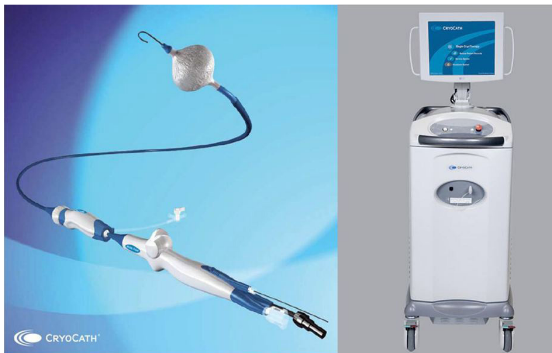
Figure 1: The Arctic Front© Cryoballoon Catheter with the FlexCath© steerable 12F sheath. To the right, the Cryoconsole© main apparatus is shown.

The cryoballoon catheter (Arctic Front©, CryoCath Technologies, Montreal, Canada) consists of a double-walled balloon, where the refrigerant N 2 O is delivered into the inner lumen, undergoing a liquid-to-gas phase change resulting in rapid cooling down to approximately -80°C (Figure 1). Two balloon sizes are available: 23 and 28 mm diameters. The bidirectionally deflectable catheter is equipped with central lumina for the insertion of a guide wire and injection of contrast medium. After placement of the guide wire into a PV, the catheter is advanced over this wire near the PV ostium where the balloon is inflated. Once in position, a PV angiogram is performed via the distal end of the balloon to ensure circumferential tissue contact. The catheter is used in conjunction with a deflectable 12-French transeptal sheath (FlexCath ©, CryoCath Technologies, Montreal, Canada), which contributes to the operators ability to position the balloon within the left atrium. Given the principals of cryogenic tissue injury, a freezing time of 5 minutes is considered sufficient. 12 Based