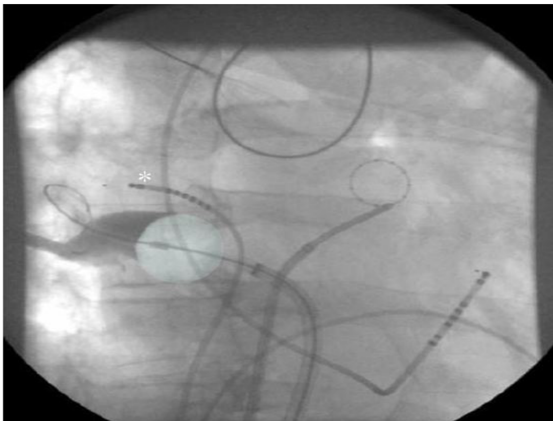
Figure 3: The cryoballoon in occlusive position at the right superior PV ostium as confirmed by PV angiography (RAO view). A octapolar catheter is in position to perform phrenic nerve pacing in the superior caval vein (asterisk)

Cryoballoon-based PV isolation in conjunction with the “single big balloon” technique provides excellent safety and is technically less demanding when compared to RF catheter ablation in selected patients. Thus, the device constitutes a valuable augmentation of the electrophysiologists armamentarium to treat paroxysmal AF. Chronic lesion assessment after cryoballoon PV isolation needs to be addressed in future studies.